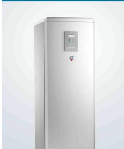
Diplomat Duo Optimum