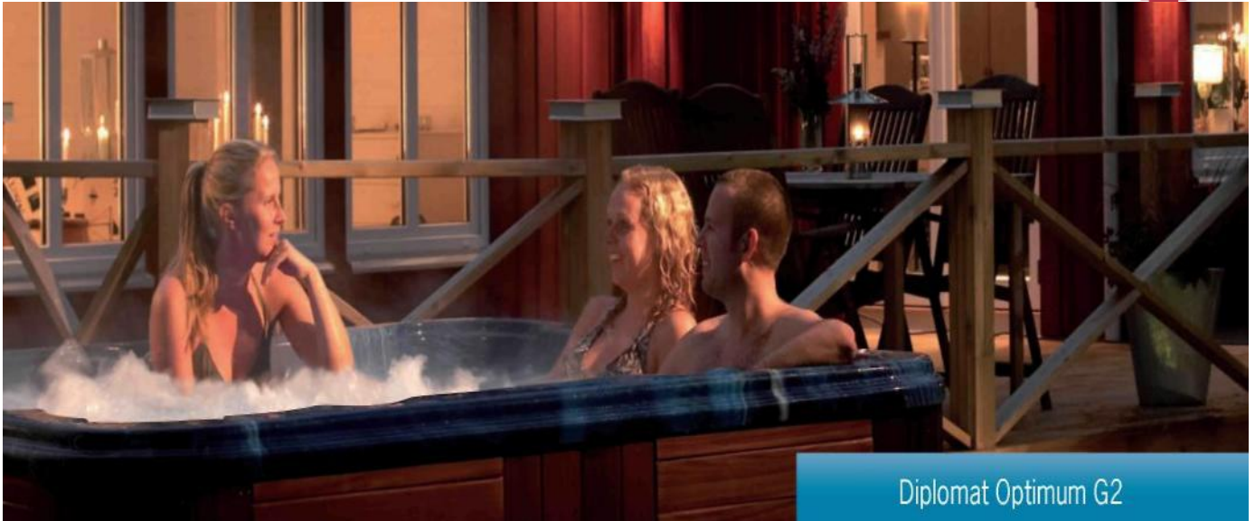
Diplomat Optimum G2